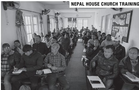
NEPAL HOUSE CHURCH TRAINING