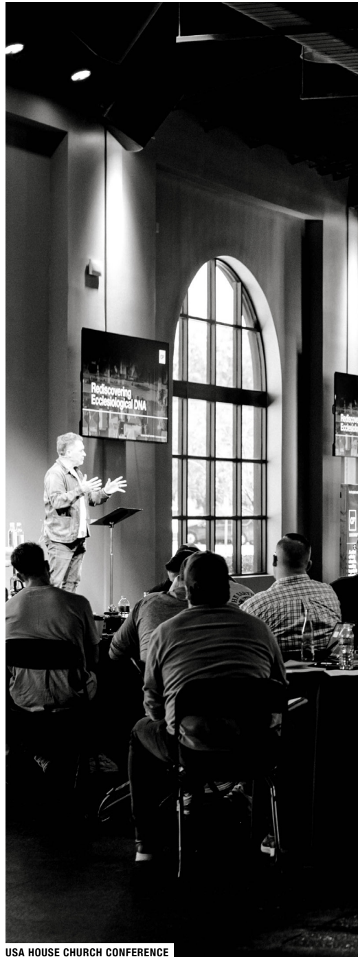
USA HOUSE CHURCH CONFERENCE