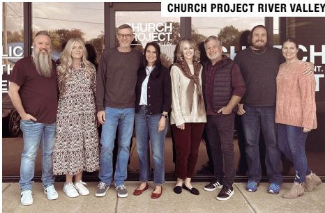
CHURCH PROJECT RIVER VALLEY

These visits strengthen the Alignment of Doctrine, Structure, and Pillars between each local church and Church Project.